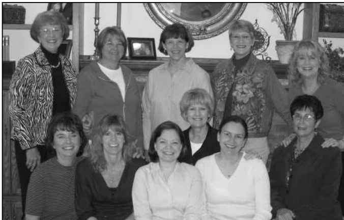
The Northern and Southern California Springs Teams